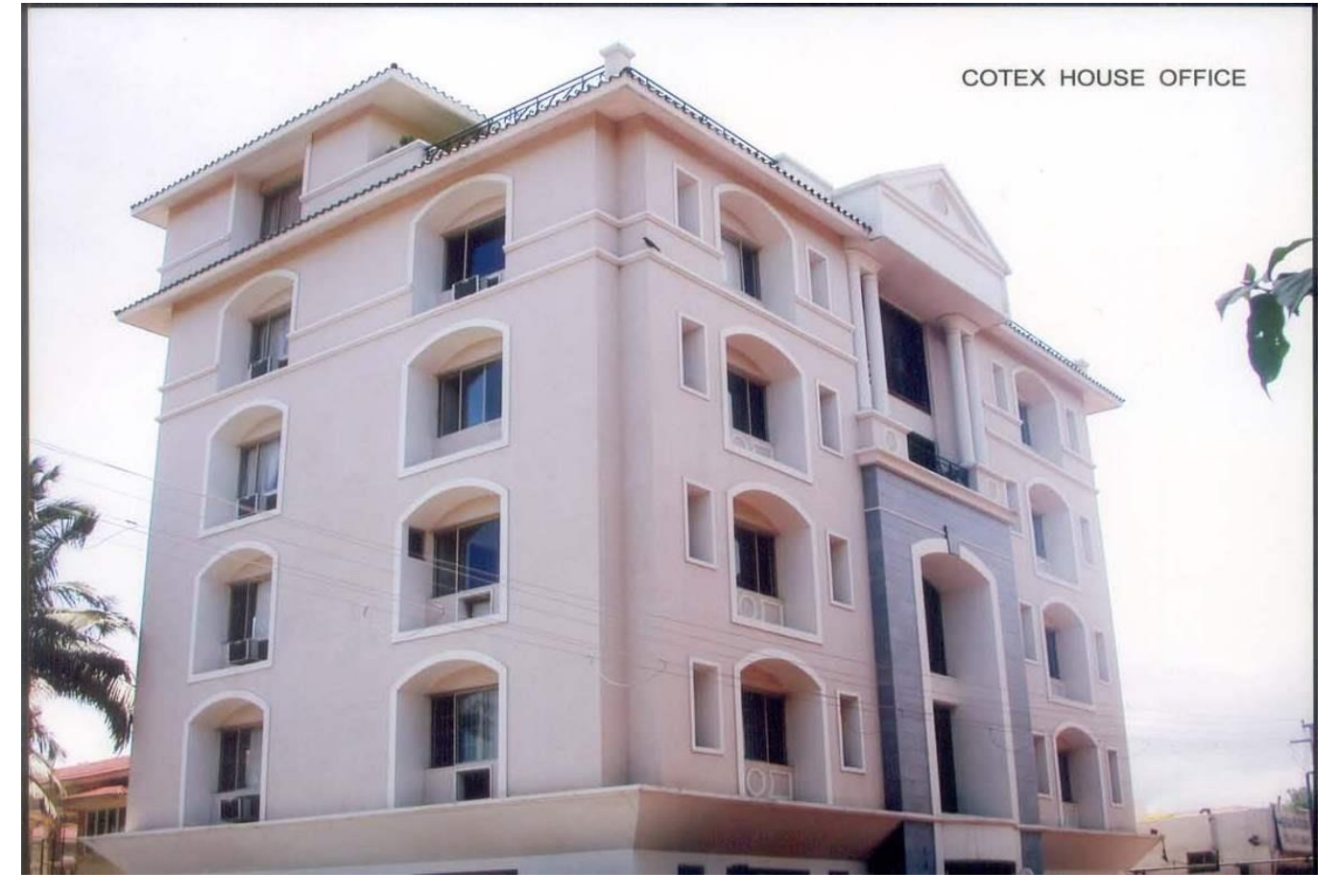
LABORATORY - SAMPLING - MERCHANDISING - QUALITY CONTROL - SHOWROOM - GUEST HOUSE