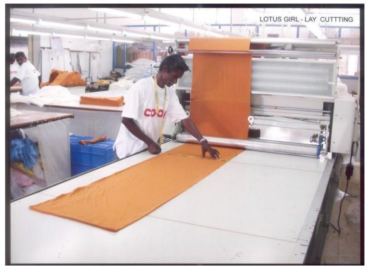
Spreader at Work